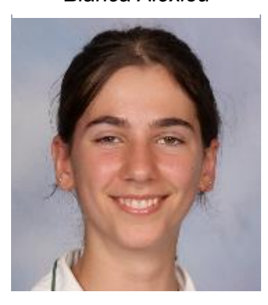
1<sup>st</sup> in 100m 2<sup>nd</sup> in 200m 1<sup>st</sup> in Long Jump and new school record