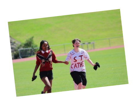
Winning House for Athletics Day: St Catherine's