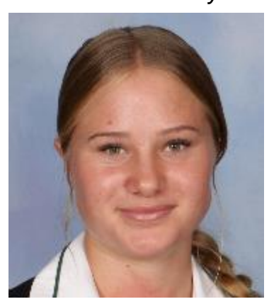
1<sup>st</sup> in 100m 1<sup>st</sup> in 200m 1<sup>st</sup> in Long Jump and new school record